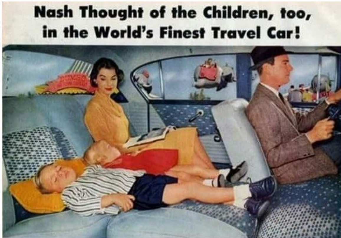
Safety was obviously less important at the time.