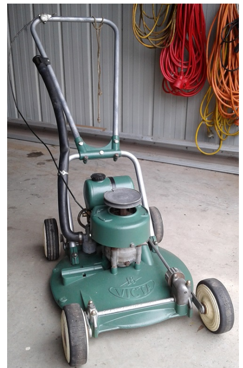
Two recent restoration projects - Generator & Mower (c 1958)