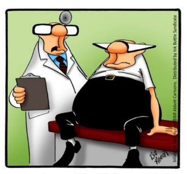
"Good news. The pain in your chest wasn't a heart attack. It was your belt buckle."

l thought growing old would take longer.