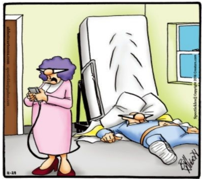
"How do you know this isn't the button for the nurses' station?"