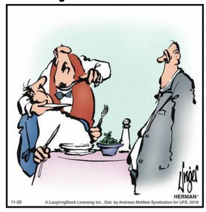
"I'll have a table for you in two minutes."