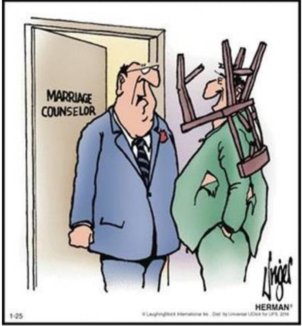
"Sorry to keep you both waiting out here. Where's your wife?"