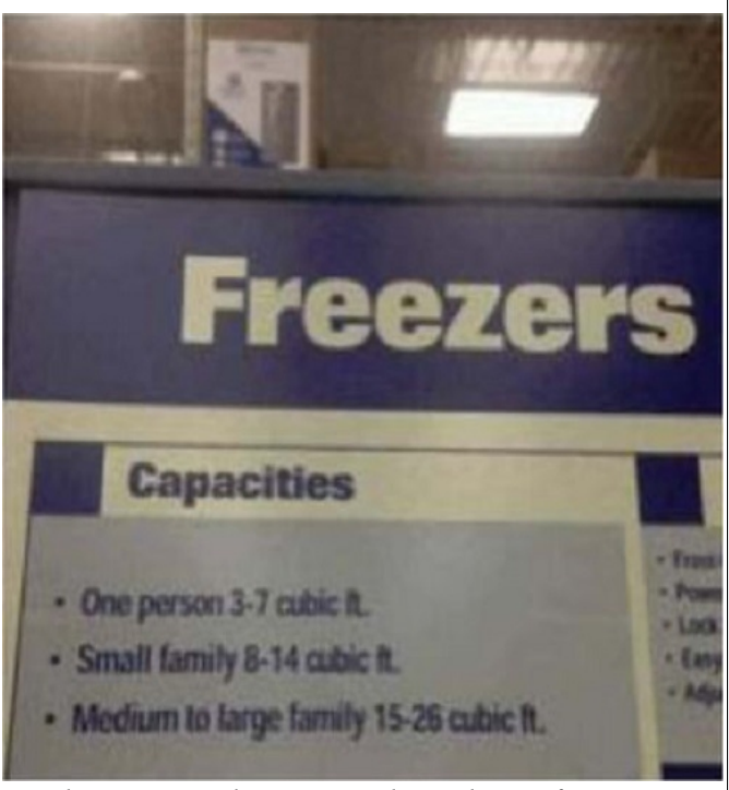
Appliance Retailers are making things far too easy for serial killers.