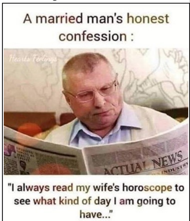
For a Laugh.