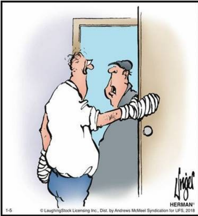
“You the guy with the hedge trimmer for sale?”