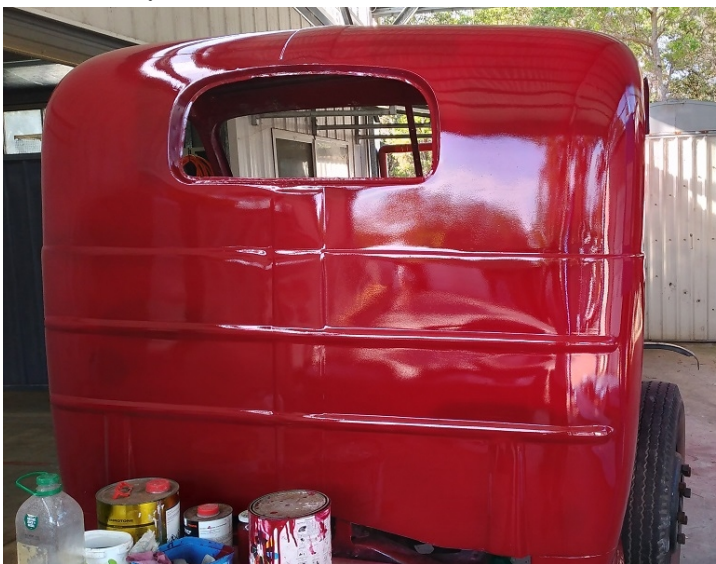
A new surge of enthusiasm amongst the metal workers has resulted in completion of the painting. Still more work to be done before it is ready for sale.